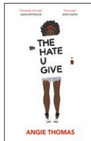
“The Hate You Give,” by Angie Thomas