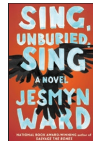
“Sing, Unburied, Sing,” by Jesmyn Ward